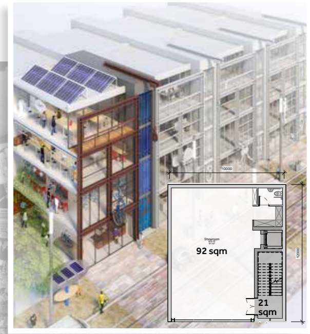
TYPICAL IIP UNIT